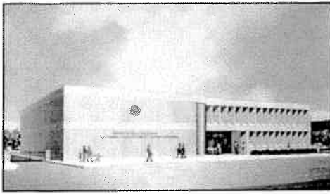
Branch 11's Headquarters