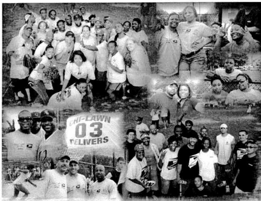
Elsdon and Chicago Lawn Stations met at a nearby park on a recent summer Saturday after work to have a picnic and a friendly game of softball.